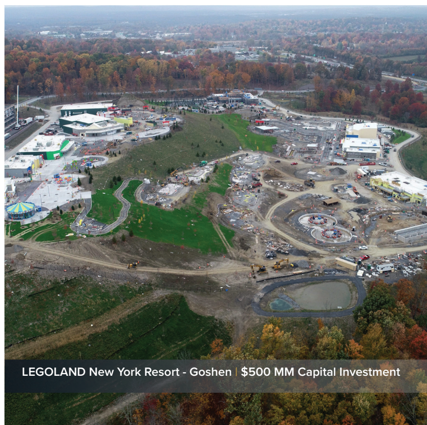
LEGOLAND New York Resort - Goshen | $500 MM Capital Investment