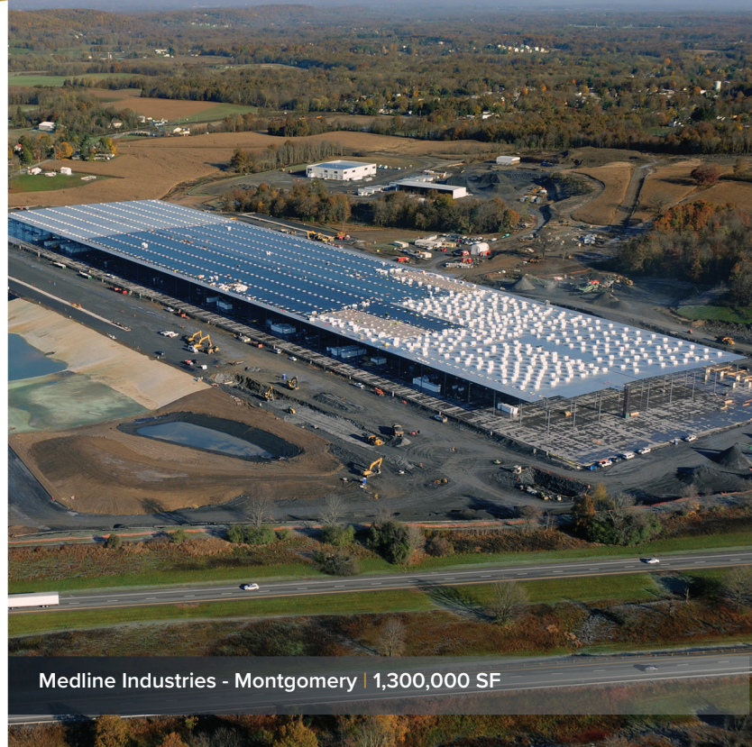
Medline Industries - Montgomery | 1,300,000 SF