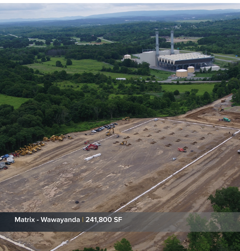
Matrix - Wawayanda | 241,800 SF