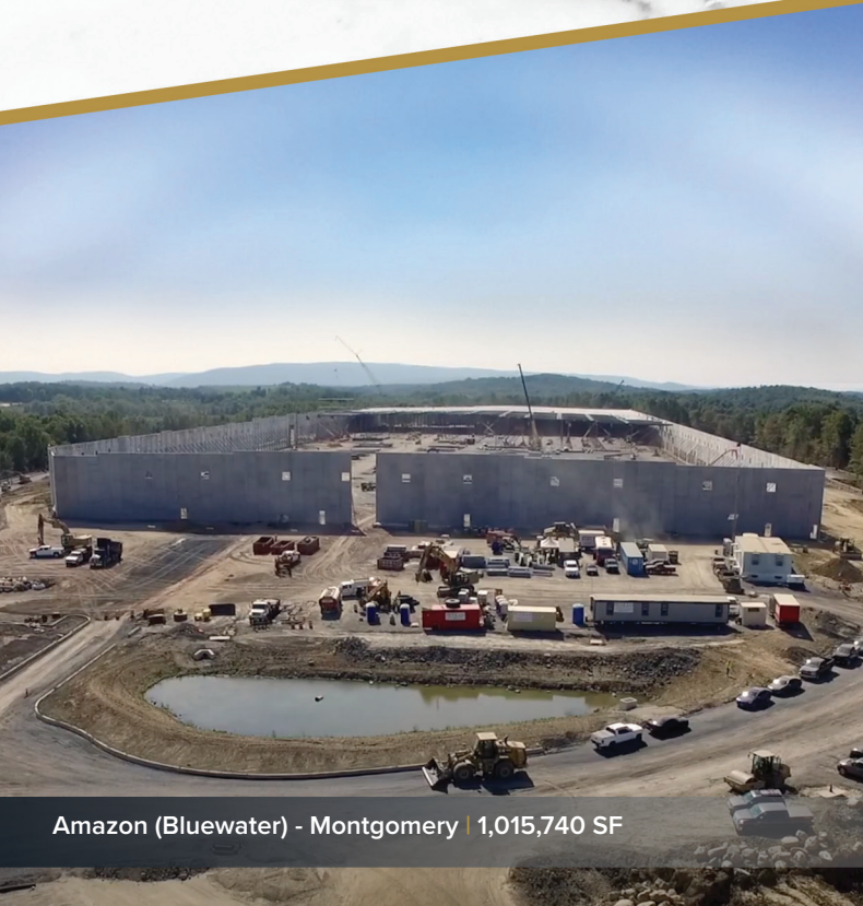
Amazon (Bluewater) - Montgomery | 1,015,740 SF